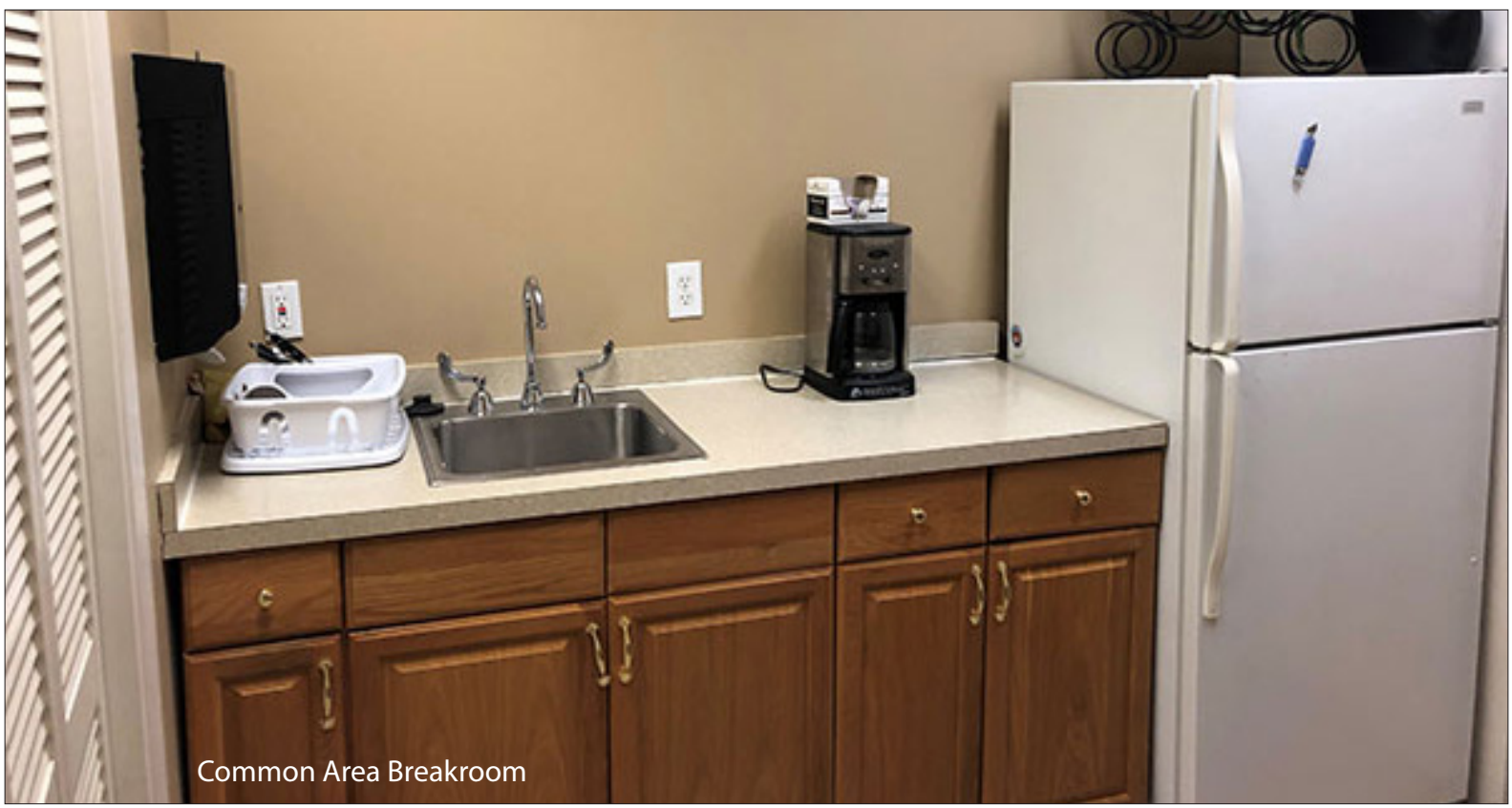
Common Area Breakroom