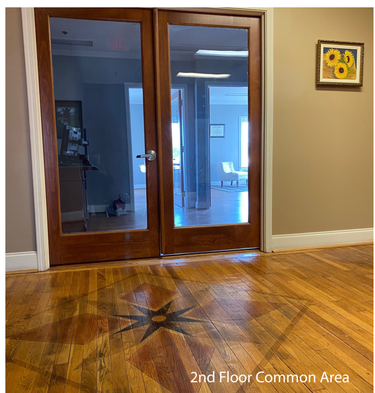
2nd Floor Common Area